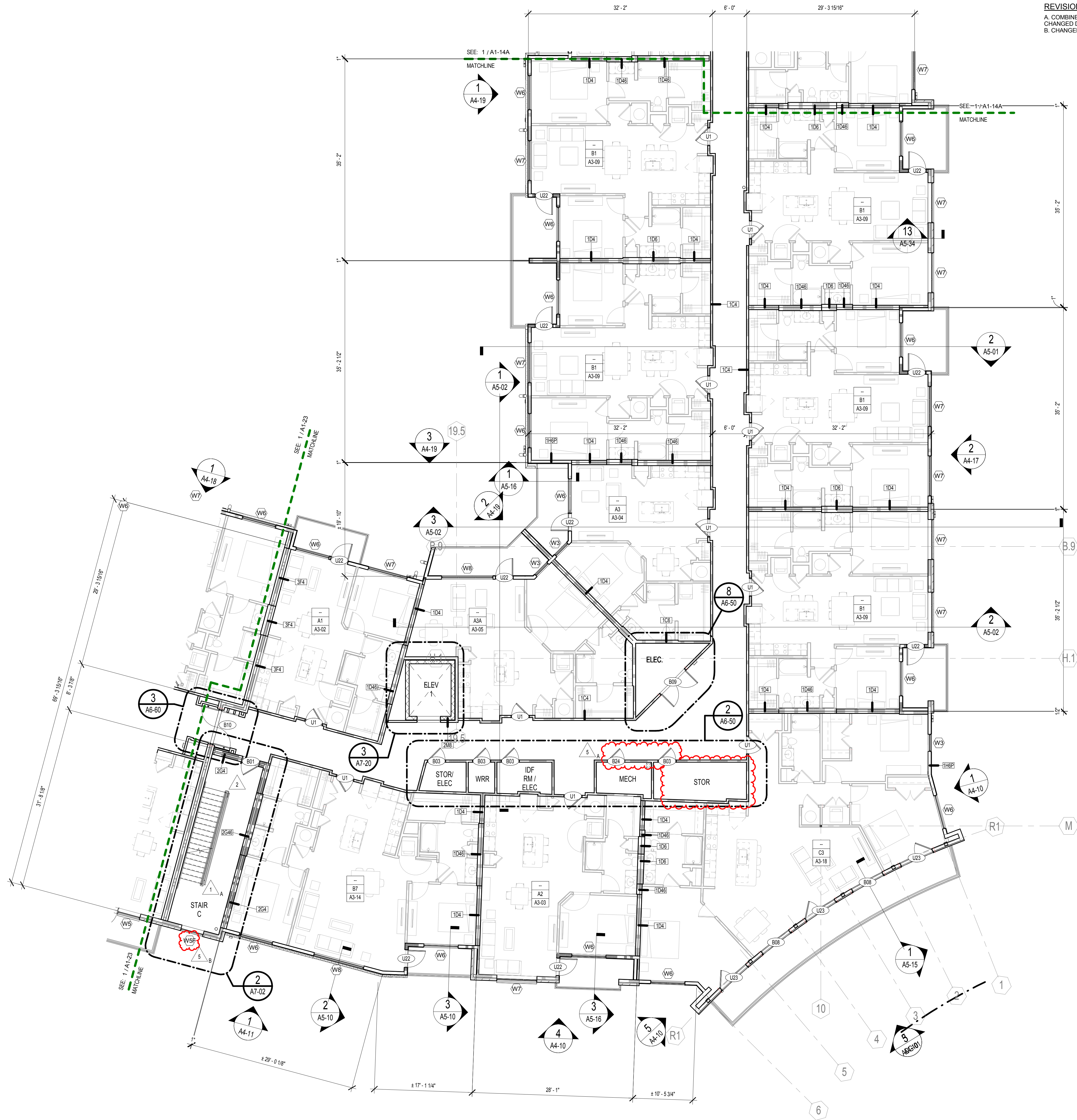
1 BUILDING 1000B - PROJECT LEVEL 4 SCALE: 1/8" = 1'-0"

C:\Data File\Revit (2016) 1493101 Circle 75 IL R16-C_1493101.rvt 10/4/2017 4:21:10 PM