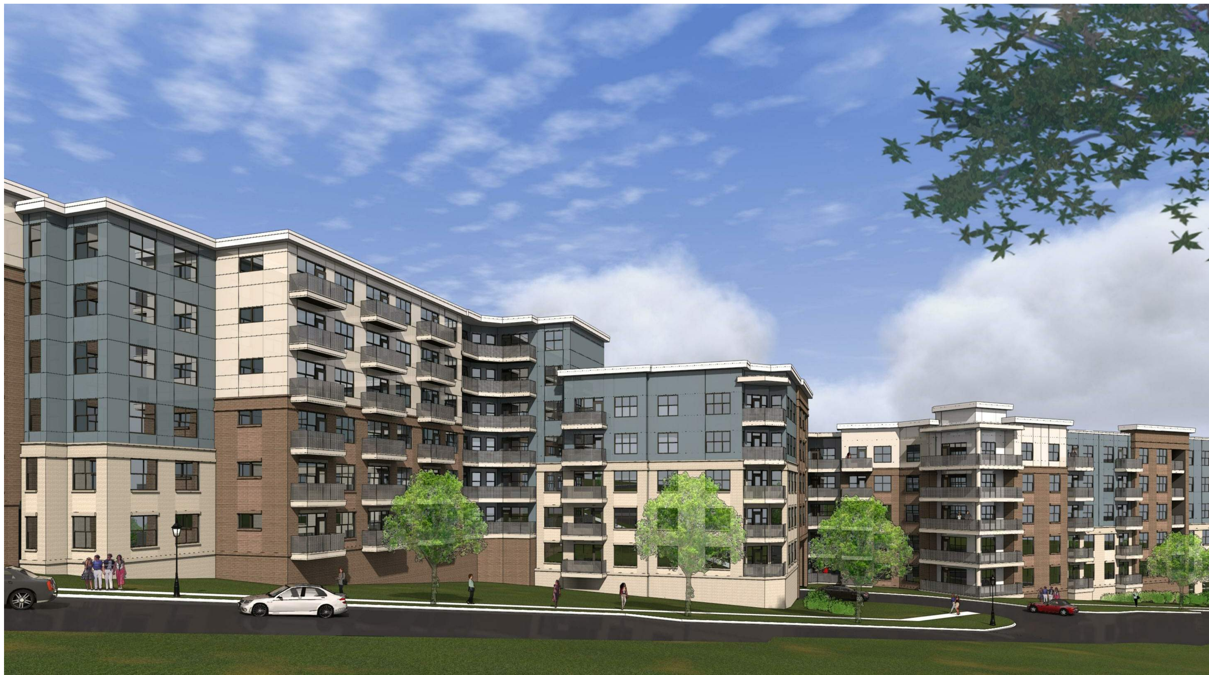
2 RENDERING - OVERALL SCALE: 8" = 1'-0"