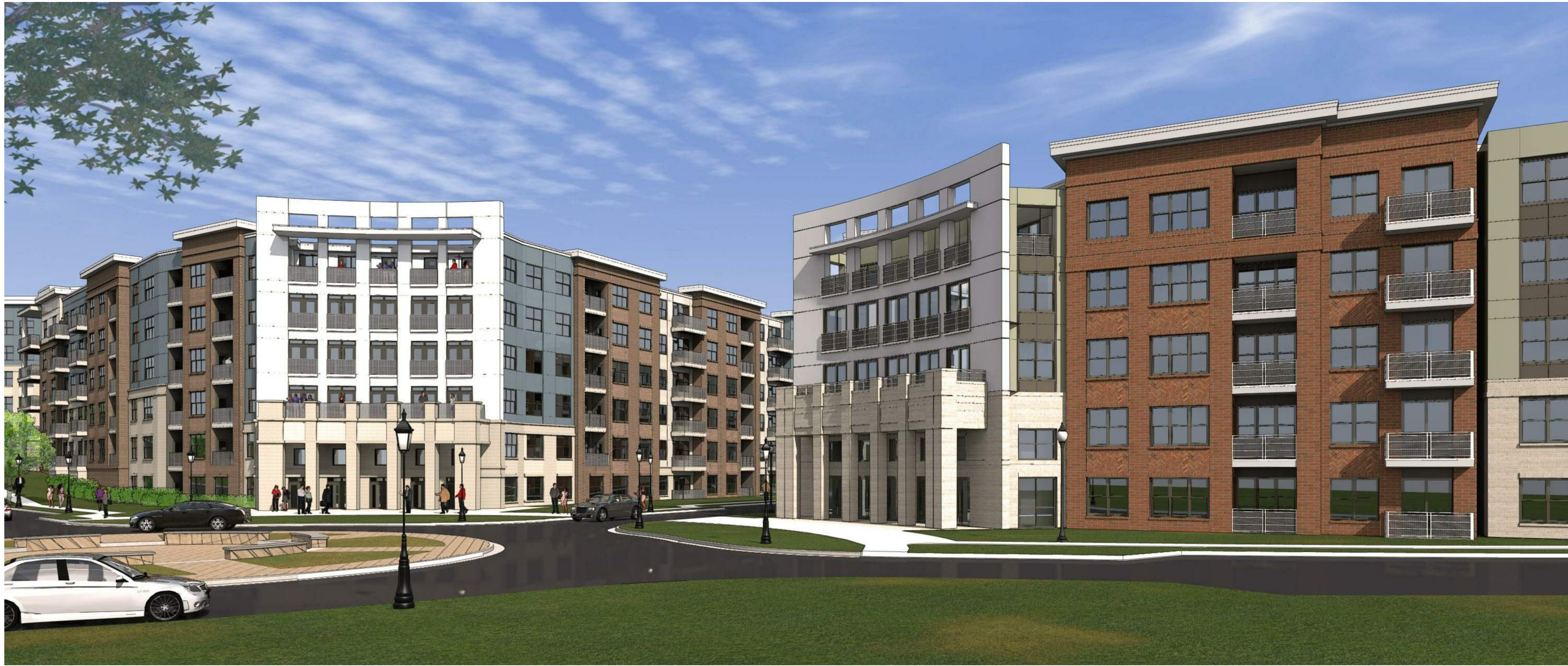
1 RENDERING - MAIN ENTRY SCALE: 8" = 1'-0"