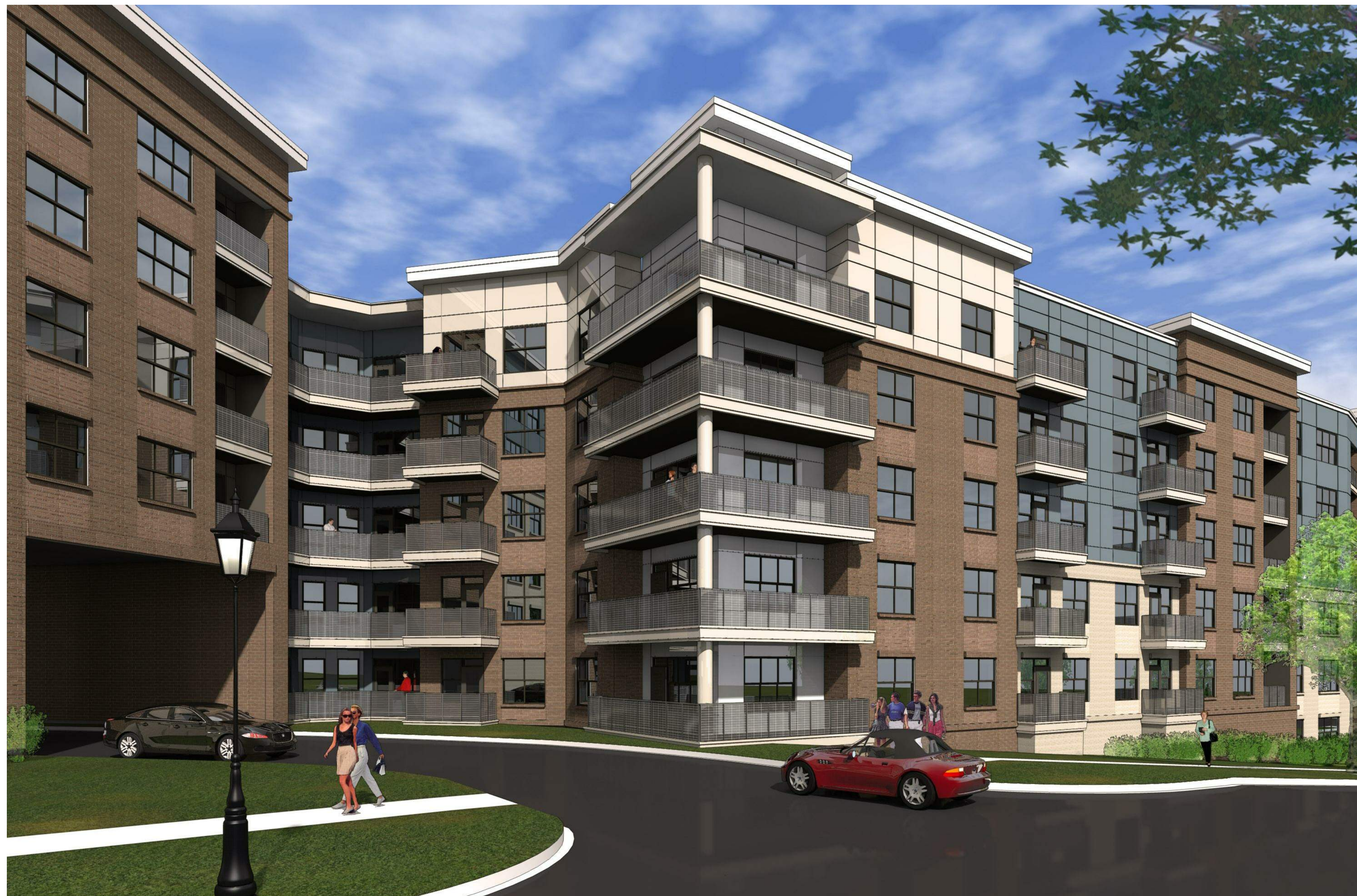
2 RENDERING - PARKING ENTRY NOT TO SCALE