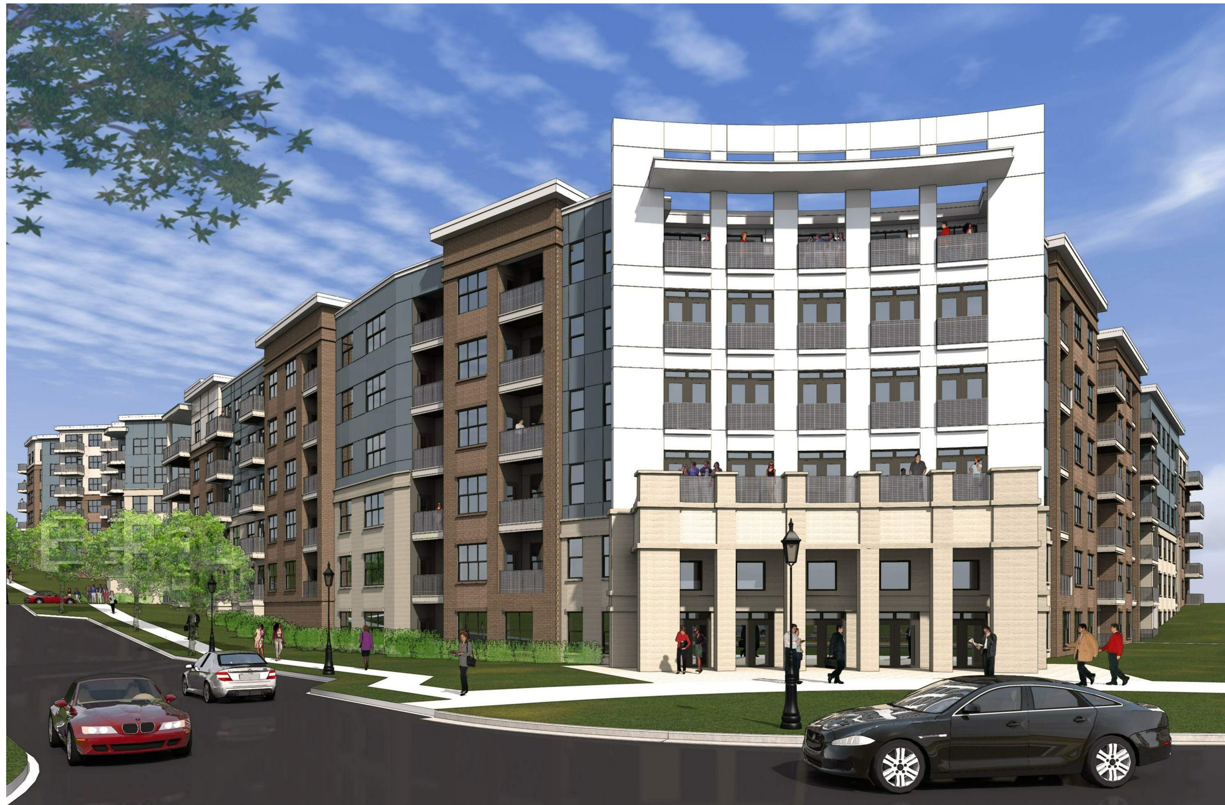
1 RENDERING - ENTRY DETAIL NOT TO SCALE