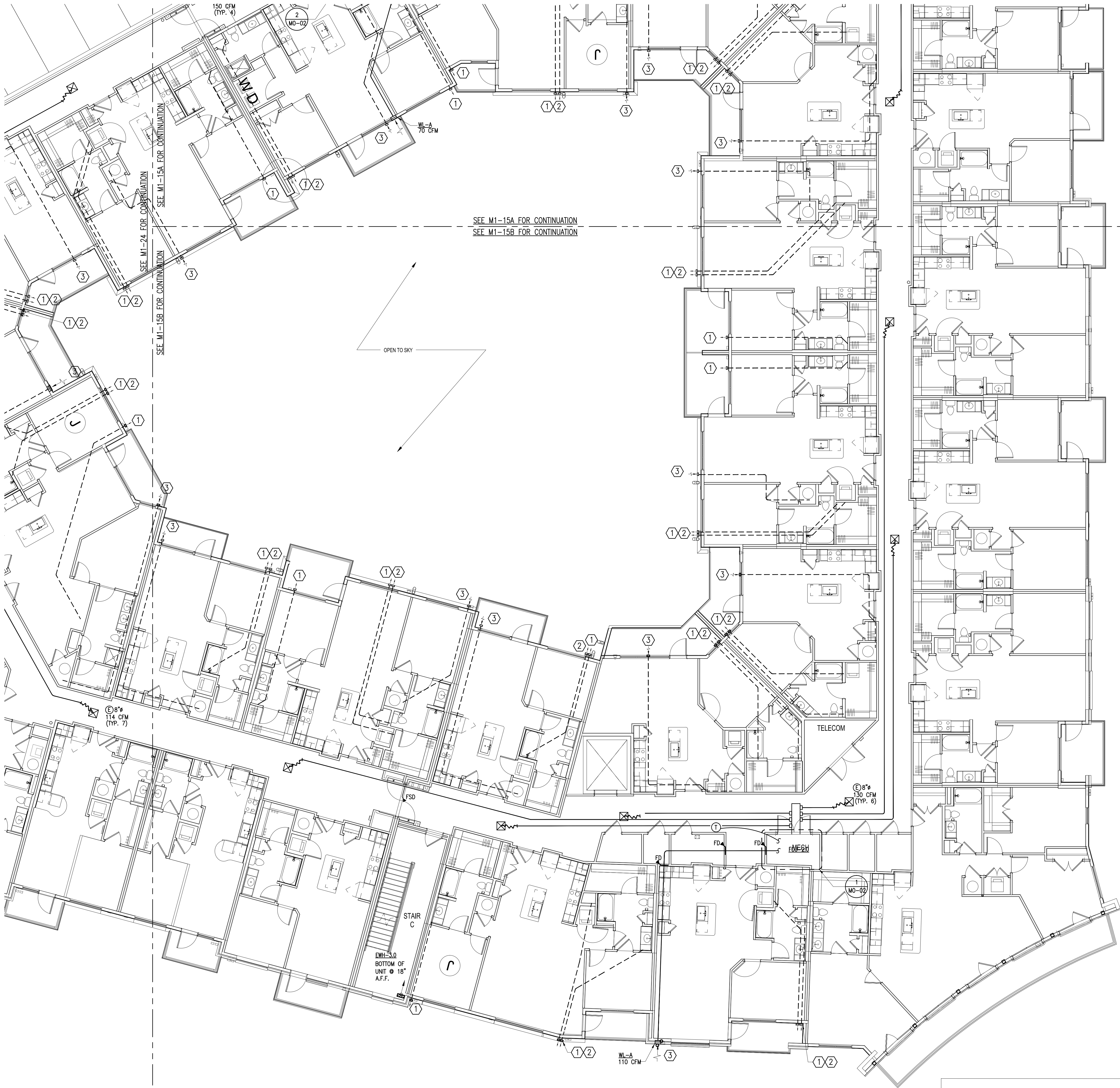
1 BUILDING 1000B PROJECT LEVEL 5 SCALE: 1/8" = 1'-0"