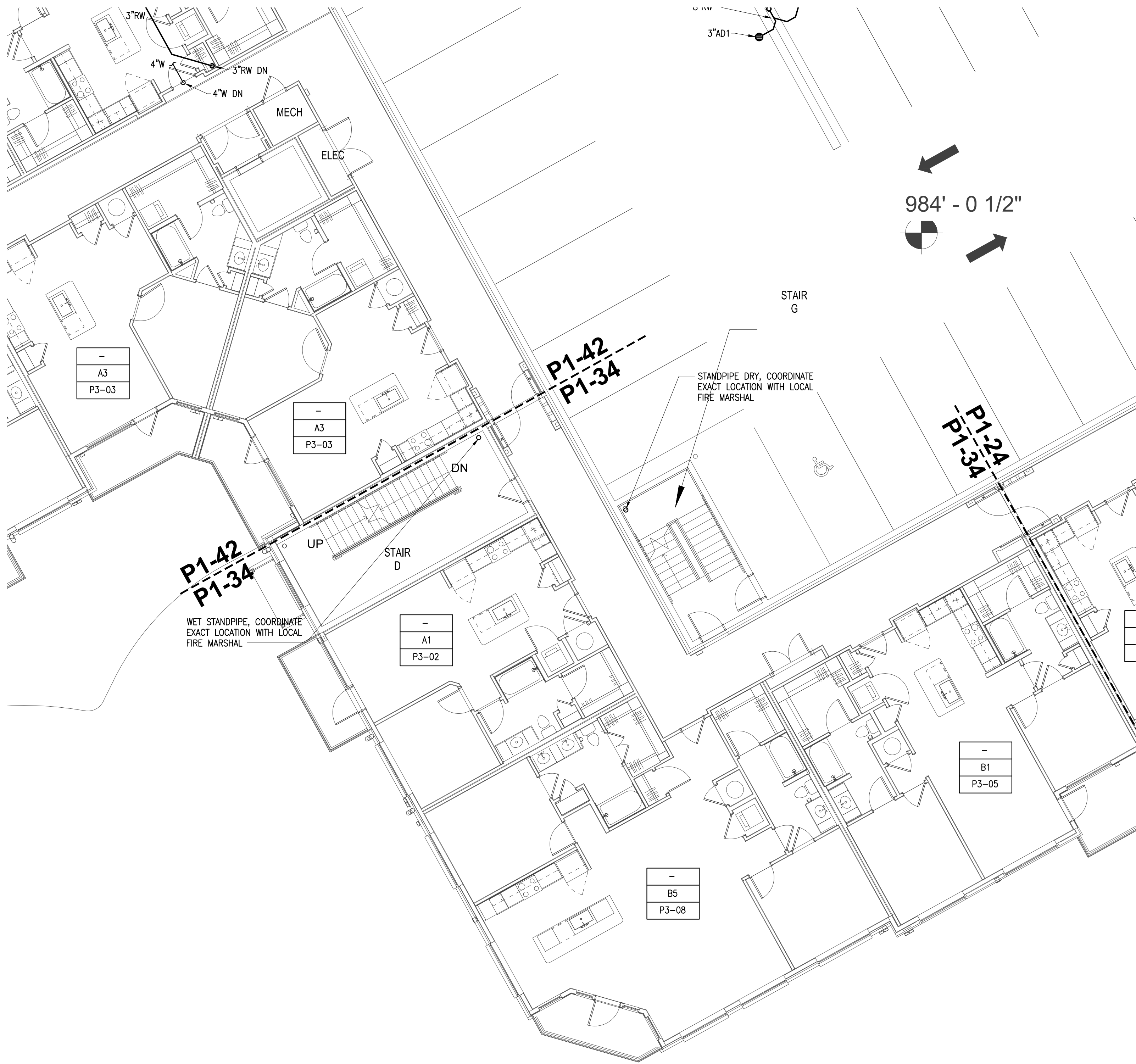
1 BUILDING 3000 PROJECT LEVEL 5 SCALE: 1/8" = 1'-0"

NOTES: 1. SEE SHEETS P0-01, P0-02 AND P0-03 FOR GENERAL NOTES, SCHEDULES AND DETAILS. 2. SEE P-3XX SERIES FOR UNIT PLAN WASTE, VENT AND WATER PIPING.