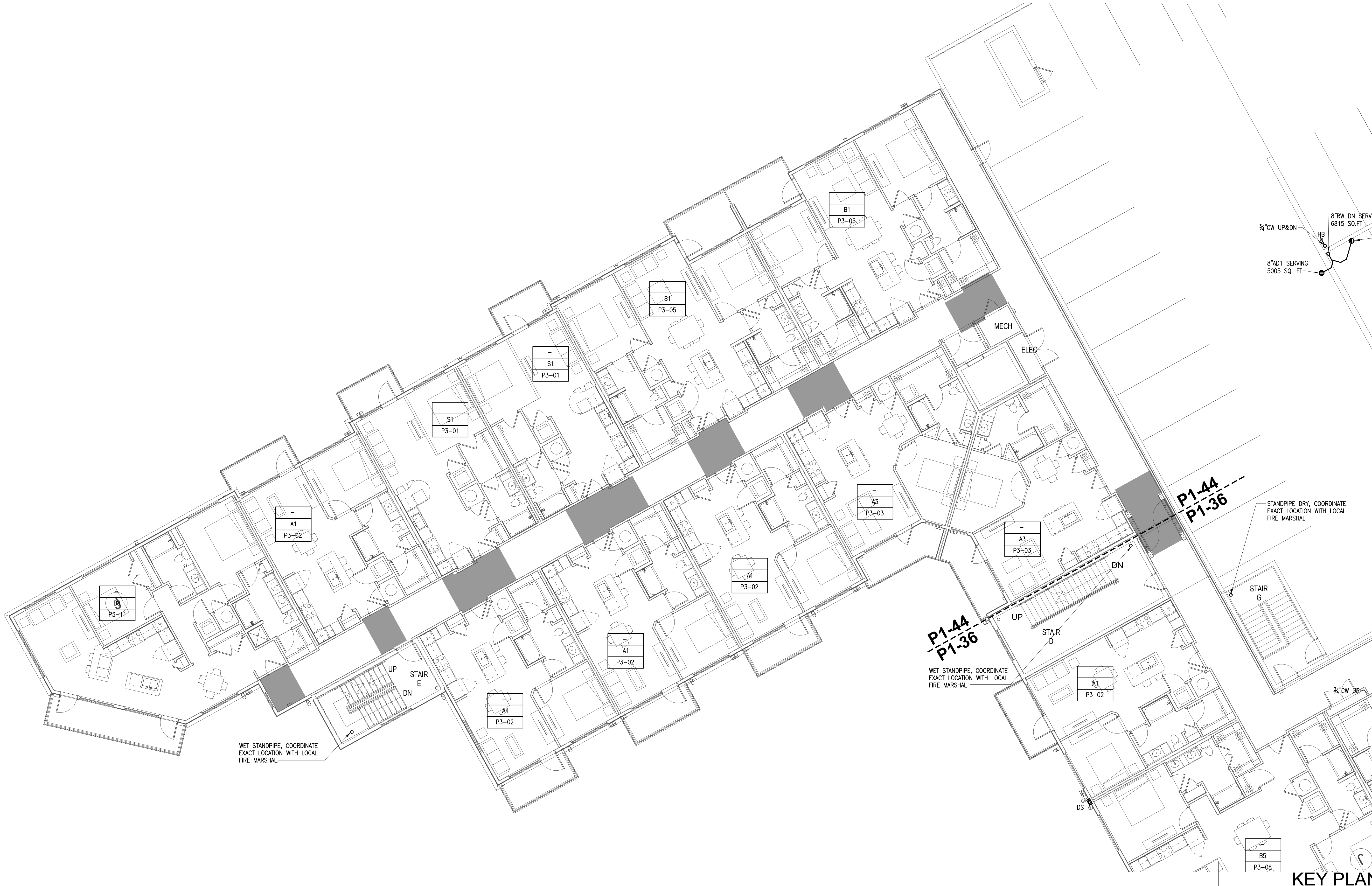
1 BUILDING 4000 PROJECT LEVEL 7 SCALE: 1/8" = 1'-0"

30X42 © 2017 The Preston Partnership, LLC