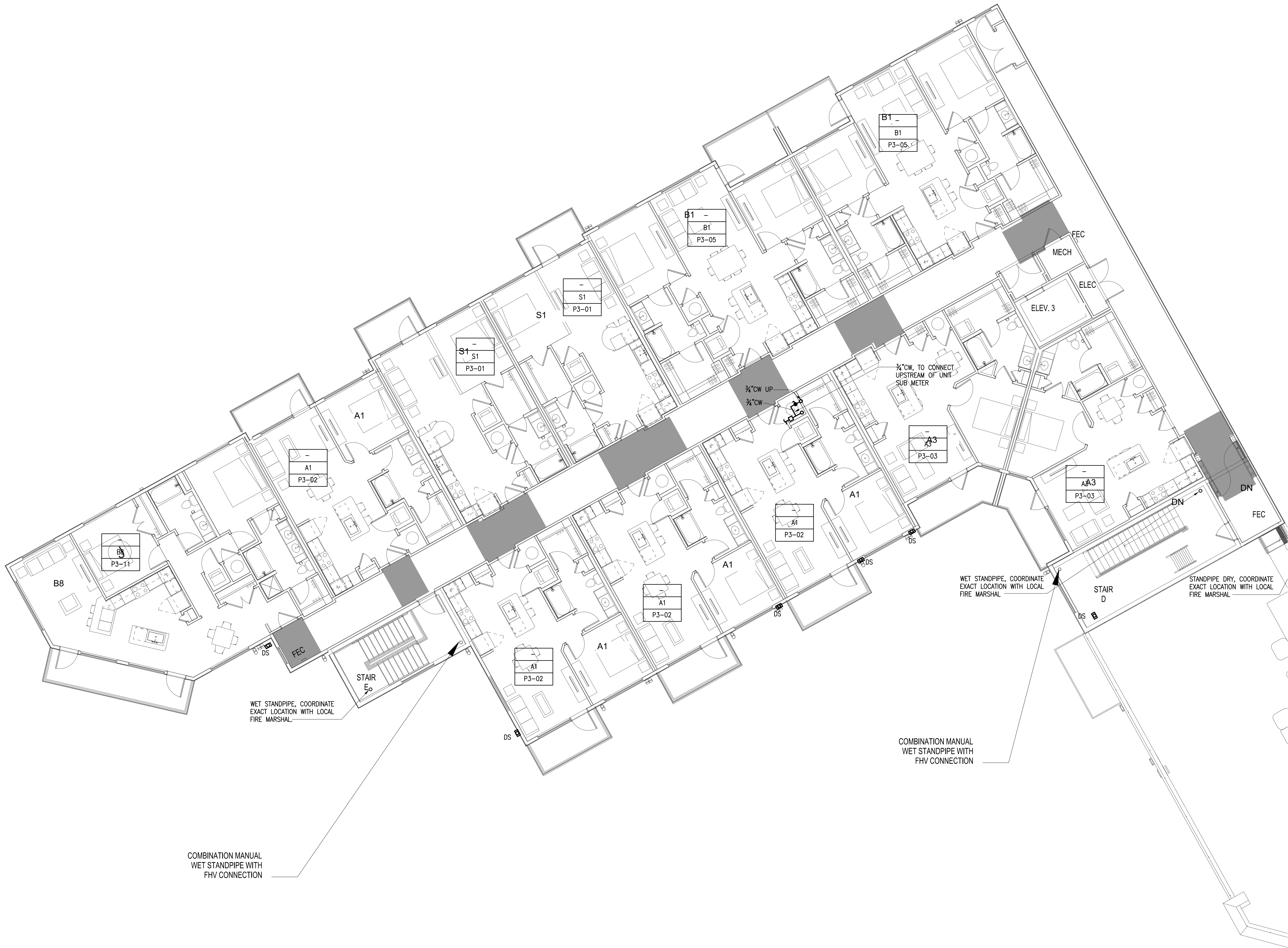
1 BUILDING 4000 PROJECT LEVEL 9 SCALE: 1/8" = 1'-0"

11/02/2017 4:50:43 PM V:\015085-Cone 15 Phase II\MECH\2017\UNSATISFACTORY\1-101483101-Cone 15 L R\14-Corridor